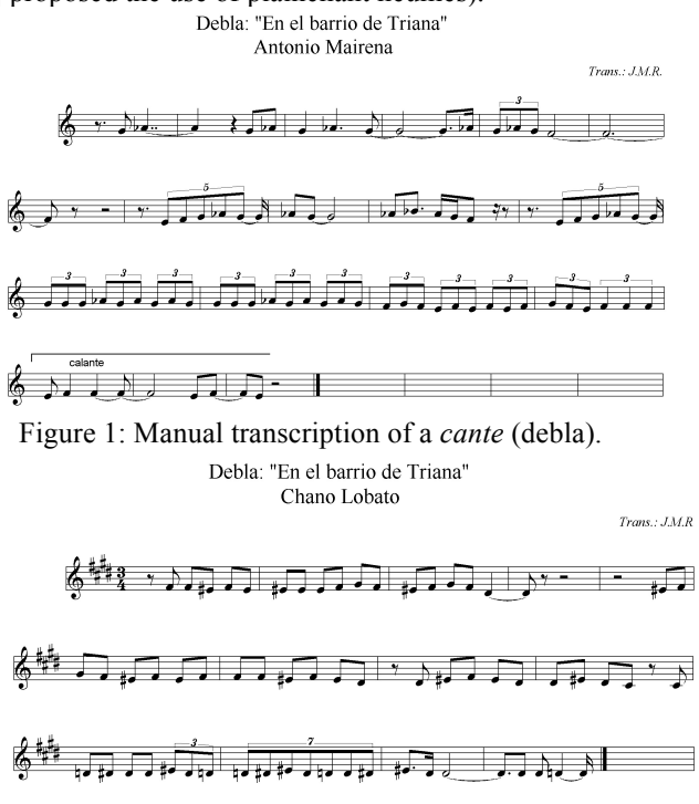
Figure 2: Transcription of another version of the previous cante .

In order to put the reader in the position of understanding this point, in Figures 1 and 2 we show a transcription of two versions of the same cante to Western musical notation. In this respect, Western notation has been found limited for this kind of music (e.g. Donnier [4] proposed the use of plainchant neumes).